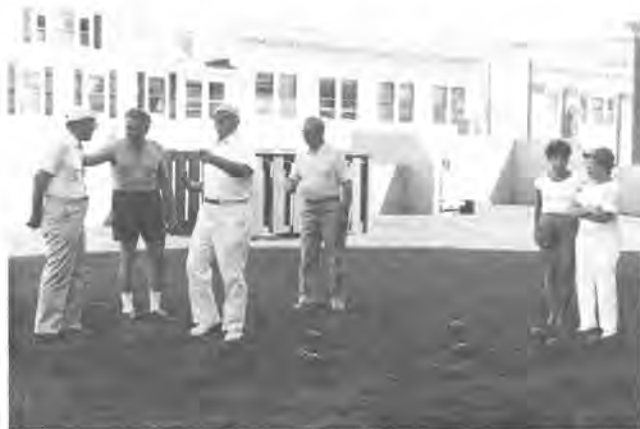
Bocce is still a popular activity at the convention.