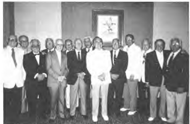
A fine group of "Alumnus Emeritus" were in attendance at Lake Placid. (These brothers have all been members of Alpha Phi Delta for at least 50 years.)