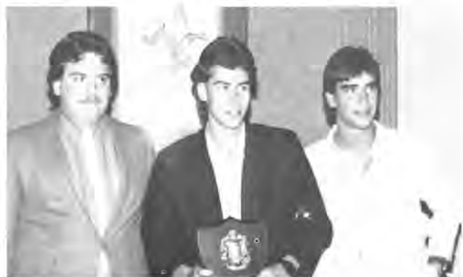
Brothers from Beta Phi accept their award as Most Improved Chapter.

Beta Phi has worked very hard to achieve their goals for the past year. This is only the beginning of the great things that they have planned for the upcoming year.