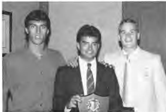
Brothers from Beta Rho accept their award as Outstanding Chapter for 1986.

The spring semester began with our usual Friday night parties. It was good to come back refreshed from Christmas break, and be ready to tackle a new semester.